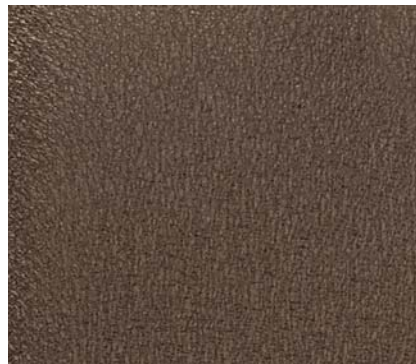
Deep Royal QC9842 available on 26 gauge only