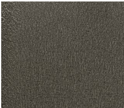
Sepia Brown QC9798 available on 26 & 29 gauge

Steel Tile is proud to offer 5 distinctive colour choices specially designed to complement any architectural vision. Crinkle SMP colours are available on select 26 and 29 gauge Steel Tile panels, including accessories, trims and flashings. The advanced Weather XL technology is formulated with a proprietary durable resin which provides superior resistance to chalking and fading, especially in extreme heat and UV exposure locations. Weather XL paint's exceptional coating hardness, flex ratio and abrasion resistance out-performs other finishes in the harshest of climates. Weather XL paint provides a new level of long term exterior performance for building product applications with the best warranty in the business.