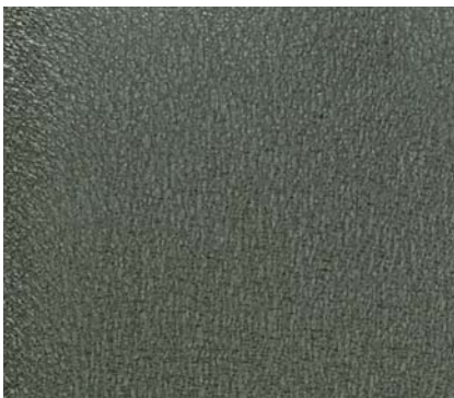
Graphite Grey QC9821 available on 26 gauge only