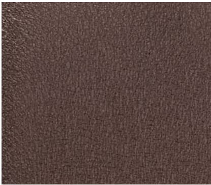
Mahogany QC9819 available on 26 gauge only